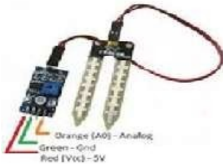
Fig 3.2.1: Soil Moisture Sensor