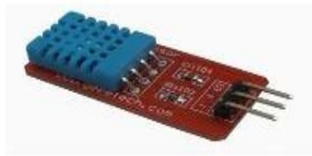
Fig 3.2.2: DHT 11(Temperature Sensor)